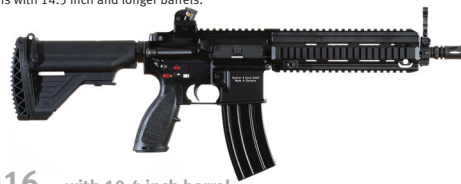
HK416 – with 10.4 inch barrel

With a 10.4 inch barrel, this HK416 variant is handy when operational demands make a short barrel more suitable. Despite its short length, accuracy matches or exceeds competing M4/M16/AR systems with 14.5 inch and longer barrels.