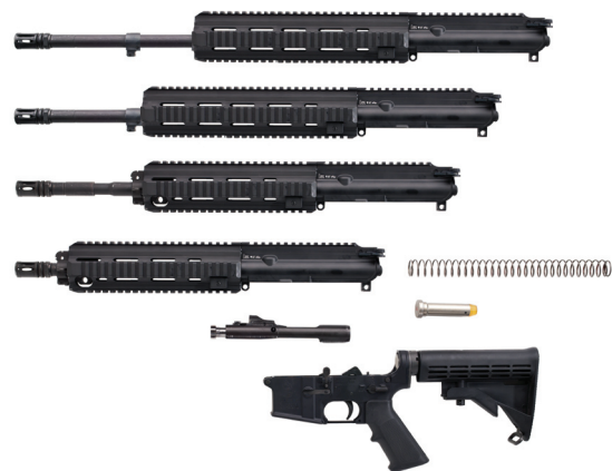
M4 type – with HK416 upper receiver kits

HK416 upper receiver kits include a complete barrel assembly (10.4, 14.5, 16.5, or 20 inch barrels), bolt assembly, and buffer with buffer spring and allow existing M4/M16 systems to be easily retrofitted to HK's ultra-reliable pusher rod operating system.