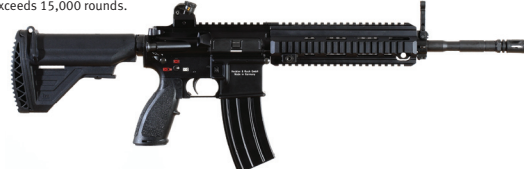
HK416 – with 14.5 inch barrel

The HK416 with 14.5 inch barrel is the variant closest to the M4 carbine. Aside from standard features like the Free Floating (Picatinny) Rail System (for optimal accuracy), barrel service life exceeds 15,000 rounds.