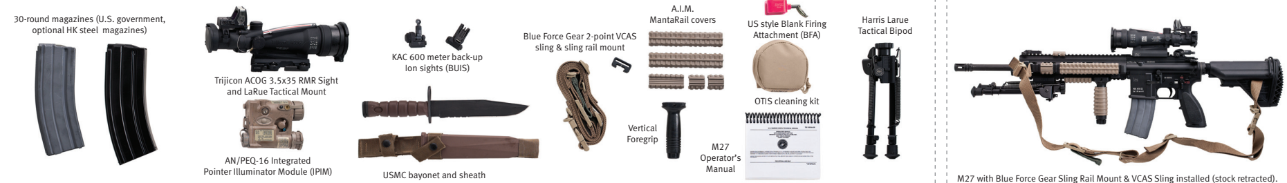
M27 with Blue Force Gear Sling Rail Mount & VCAS Sling installed (stock retracted).

The M27 Infantry Automatic Rifle is equipped with the following accessories: Knight's Armament Company Flip-Up Front and Rear Sights, Blue Force Gear VCAS Sling & Rail Mount, A.I.M. MantaRail Covers, Harris/Larue Tactical Bipod with Quick Detach or Gripod, U.S.-style Blank Firing Adaptor, (BFA), Otis Cleaning Kit, U.S. government 30-round magazine (HK magazines optional), Trijicon Squad automatic weapon Day Optic (S.D.O.), and USMC bayonet.