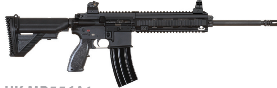
HK MR556A1 – semi-automatic with 16.5 inch barrel

The MR556A1 is a semi-automatic variant of the HK416. Well-suited as a law enforcement patrol carbine, the highly accurate 5.56 mm MR556A1 is commercially available in most U.S. states.