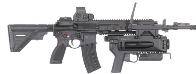
HK416 A5 carbine with HK Grenade Launcher (HK GLM fits HK416 A5 and "first gen" HK416)