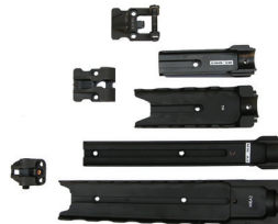
HK Grenade Launcher adaptor kits