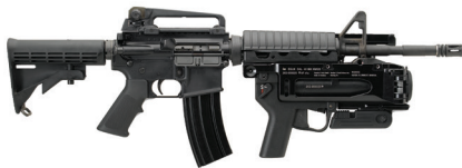
M4 Carbine with HK Grenade Launcher (GL Model "AG-M4") M320A1 includes M4 adapter kit