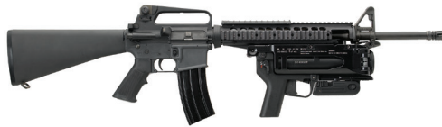
M16A4 Rifle with HK Grenade Launcher (GL Model "AG-M16A4") M320 includes M16 adapter kit,