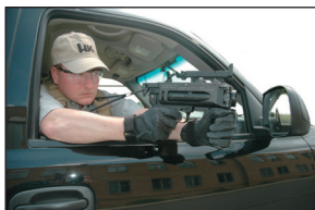
HK grenade launchers can be fired without a stock using a special bungee sling.